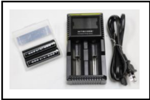
Spare Battery and External Charger

Cambridge Scale Works, Inc. 5011 Horseshoe Pike P.O. Box 670 Honey Brook, PA 19344 Ph: 800-292-7640 www.cambridgescale.com