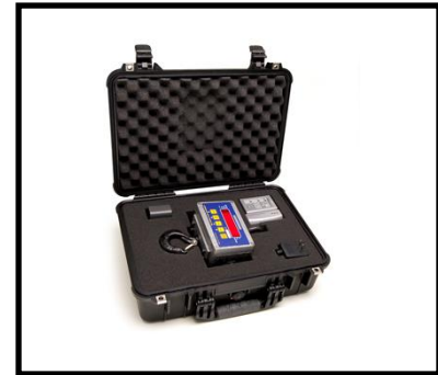
Ultra-Tough Carrying Case

Cambridge Scale Works, Inc. 5011 Horseshoe Pike P.O. Box 670 Honey Brook, PA 19344 Ph: 800-292-7640 www.cambridgescale.com