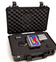
Ultra-Tough Carrying Case

Cambridge Scale Works, Inc. 5011 Horseshoe Pike P.O. Box 670 Honey Brook, PA 19344 Ph: 800-292-7640 www.cambridgescale.com