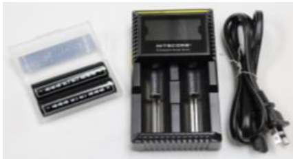
Spare Battery and External Charger