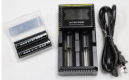
Spare Battery and External Charger