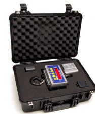
Ultra-Tough Carrying Case

Cambridge Scale Works, Inc. 5011 Horseshoe Pike P.O. Box 670 Honey Brook, PA 19344 Ph: 800-292-7640 www.cambridgescale.com