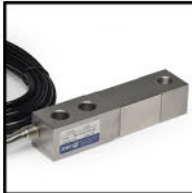
SS, hermetically sealed and/or "FM" approved load cells