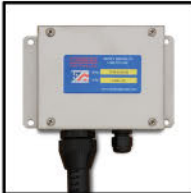
Remote stainless steel NEMA 4X junction box