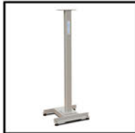
48" Indicator column* (Freestanding)