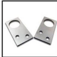
Lag down brackets* (sold individually)