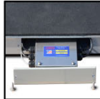
SS on-board junction box