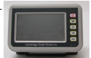
CSW-30T-LT Touchscreen Indicator