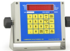
CSW-20AT-LFT Indicator COC #: 06-070A1