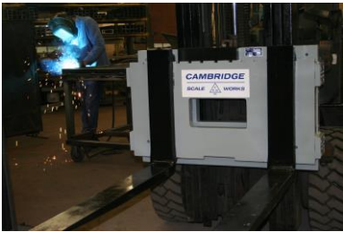
"DL" Scale Section