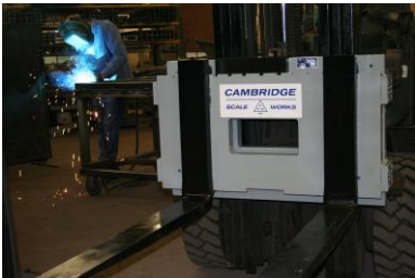
"DL" Scale Section