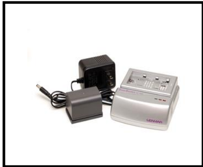
Spare Battery and External Charger

Cambridge Scale Works, Inc. 5011 Horseshoe Pike P.O. Box 670 Honey Brook, PA 19344 Ph: 800-292-7640 www.cambridgescale.com