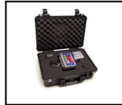
Ultra-Tough Carrying Case

Cambridge Scale Works, Inc. 5011 Horseshoe Pike P.O. Box 670 Honey Brook, PA 19344 Ph: 800-292-7640 www.cambridgescale.com