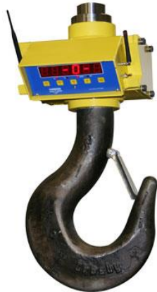
Model: ASCS-80K-RFL Shown with Optional Headroom Loss Adapter