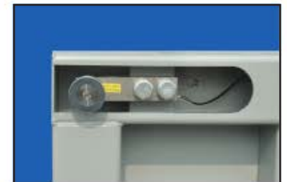
Self checking captive ball leveling feet.